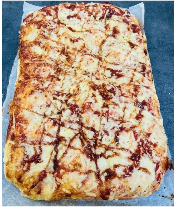
1 - Pizza

Some of our delicious school meals served this week. Ordering is online, please speak to the office if you have any issues with ordering or need to know your code. Meals for KS2 cost £2.34 per day and Universal Free School meals are available for all Foundation, year 1 and year 2 children.