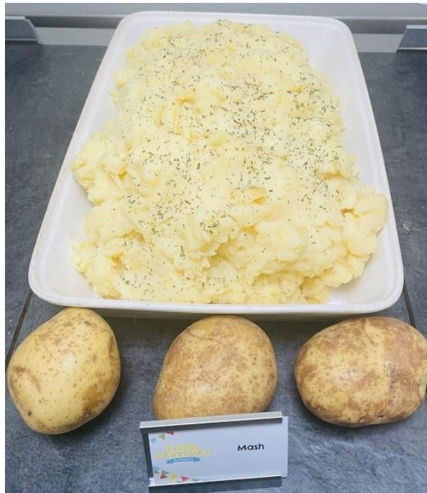
2 - Creamy Mash